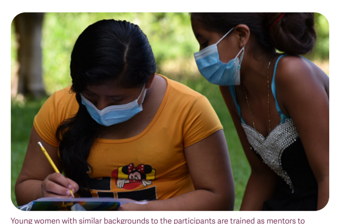
Young women with similar backgrounds to the participants are trained as mentors to deliver the programme, drawing upon their own personal experiences.

Na'leb'ak was founded by rural and urban Indigenous young women who had participated in the Abriendo Oportunidades (Opening Opportunities, AO) programme as mentors or mentees. AO was originally designed and implemented by the Population Council to support Indigenous girls to reach their full potential and break free from the cycle of poverty. From 2013 to 2018, the Population Council implemented different components of the AO programme in Chisec, Guatemala, collaborating closely with an emerging group of mentors.