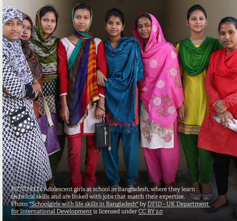
PICTURED: Adolescent girls at school in Bangladesh, where they learn technical skills and are linked with jobs that match their expertise.