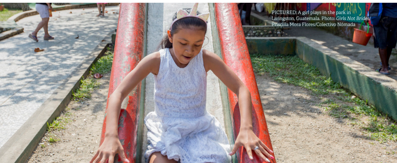
PICTURED: A girl plays in the park in Livingston, Guatemala.

As part of a comprehensive approach, social protection – especially cash transfer programmes – can help mitigate the economic and social drivers of child marriage. This thematic brief offers guidance for policymakers, practitioners and advocates to ensure cash transfer programmes contribute towards ending child marriage around the world.